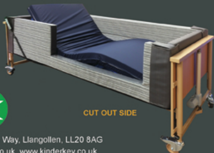
CUT OUT SIDE